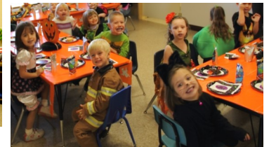
Head Start students in costume